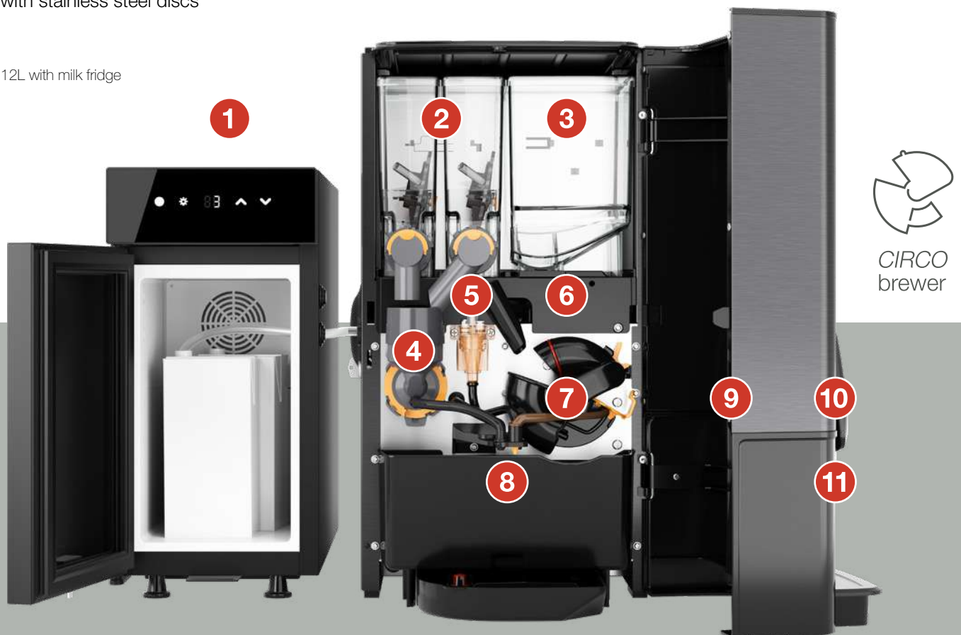
Sego 12L with milk fridge