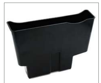
waste bin for pedestal