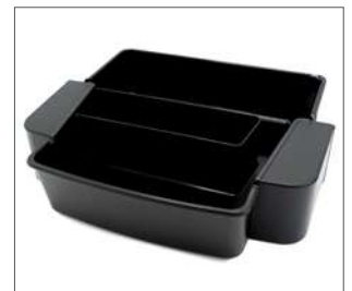
drip tray for pedestal