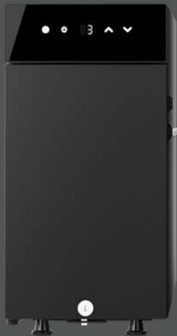
Sego L with milk fridge