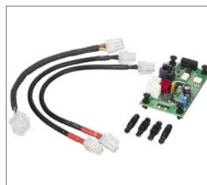
MDB service set