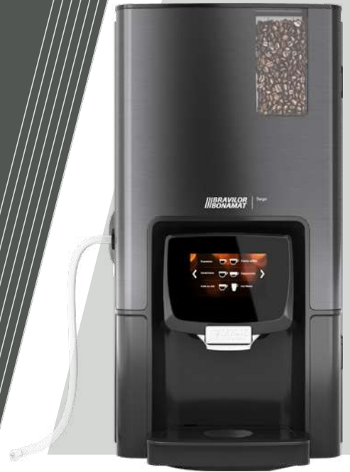
Sego L without milk fridge