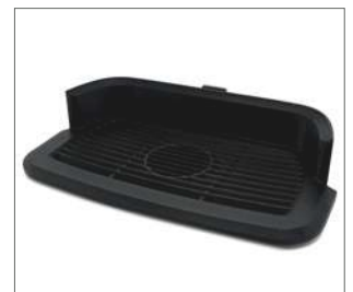
lower drip tray grid