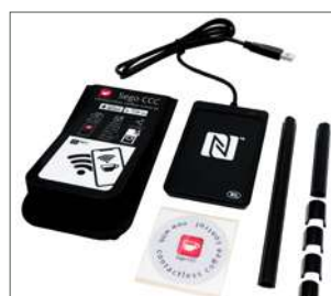
kit for Sego CCC app