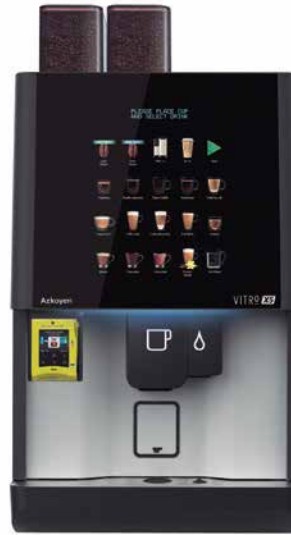
Cashless system integration option