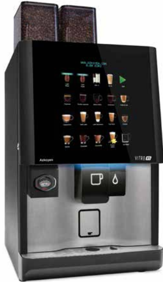
Cashless system integration option

For a self-contained operation, the Vitro X5 allows you to integrate a cashless system.