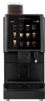
Plinth - Optional

Vitro X1 incorporates a 700 cc / 23.6 fl. Oz boiler becoming the perfect solution for a coffee service in small and medium size hotels and convenience stores, where service needs to be intuitive, good and fast. It is also the perfect solution to promote a cooperative culture in the office, offering high quality coffee, a premium user experience, and a comprehensive hot drink offer.