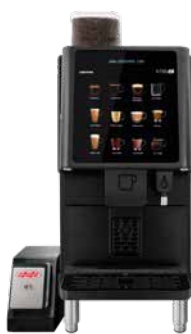
MDB Cashless module kit - Optional

Waste drawer increases capacity by up to 130 cakes (based on brewer) and 1 gal / 4L. It rises 1"/25 mm. Front removal.