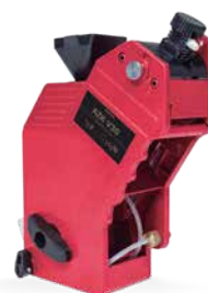
AZK V30 Espresso Group